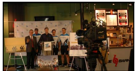
The 2009 press conference was held at the Bike Barn Kirby location.

Just as the Galveston Bay Foundation is passionate about Galveston Bay, Bike Barn is passionate about cycling and it's contagious!