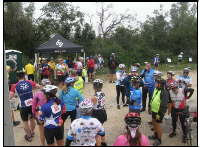
Cyclists enjoying a 2009 Bike Barn break point. Bike Barn strives to enhance everyone's cycling experience and share their passion for cycling by providing free weekly rides and one free monthly group ride. Visit www.bikebarn.com for details!

of Galveston Bay and introduces it to many Houstonians for the first time. We enjoy sharing this unique ride with our cycling friends and helping to support the great work of the Galveston Bay Foundation."