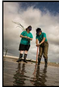
ITC and Mitsui USA volunteers planted marsh on September 19th.