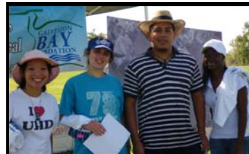
Above: University of Houston Downtown students planted marsh grass on November 6th and had a great time!