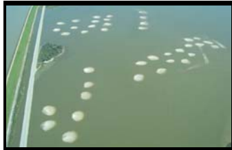
Aerial views of Burnet Bay Wetlands Restoration project.