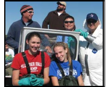
Above: "Marsh Maniacs" from NRG enjoyed a fun day of planting on October 17th! Below: ConocoPhillips volunteers have time for a photo opp. after all the planting they accomplished!